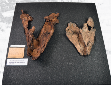
Neopolen Tray for Geiseltalfossilien

The plastic products marketed as Neopolen and Ethafoam are physically-formed polyethylene foam. These products contain a small amount of additives, which occur naturally and do not produce harmful exhalates such as acids. The material is produced in panels of varying thickness and hardness. The material is light-weight, resists moisture, and resists aging.