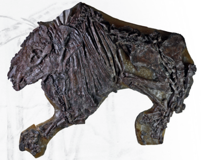
„Urpferd“, Propalaeotherium isselmanni

Although well preserved, many of the Geiseltal fossils are very delicate and are easily damaged. An initial step toward fossil conservation is to digitize specimens using a 3D scanner. A record is then created of the initial status of the fossil (at the time of scanning) and can be used later as a reference to determine if the specimen is degrading over time. Thus any issues can be addressed before they worsen. Following digitization, with the help of Computerized Numerical Control (CNC) milling technology, digital files can be used to create form-fitting support cradles for fossil specimens. In addition, digital files can be made available internationally to researchers, potentially removing the need for specimen