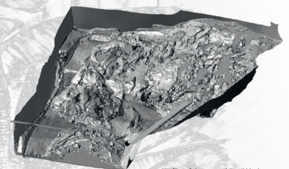
STL files of the scanned Fossil block

The 3D surface data from the scanner requires further processing with a 3D modeling program, such as netfabb. The software can create a virtual 3D negative impression of the digital object with the help of boolean operation. The 3D digital file of the negative impression can then be read by the control software for a CNC milling machine, which then calculates the 3-axis route needed for the step-motors. A CNC portal milling machine table works well for printing the negative impressions from panels of polyethylene foam. The method works best when at least one dimension of the