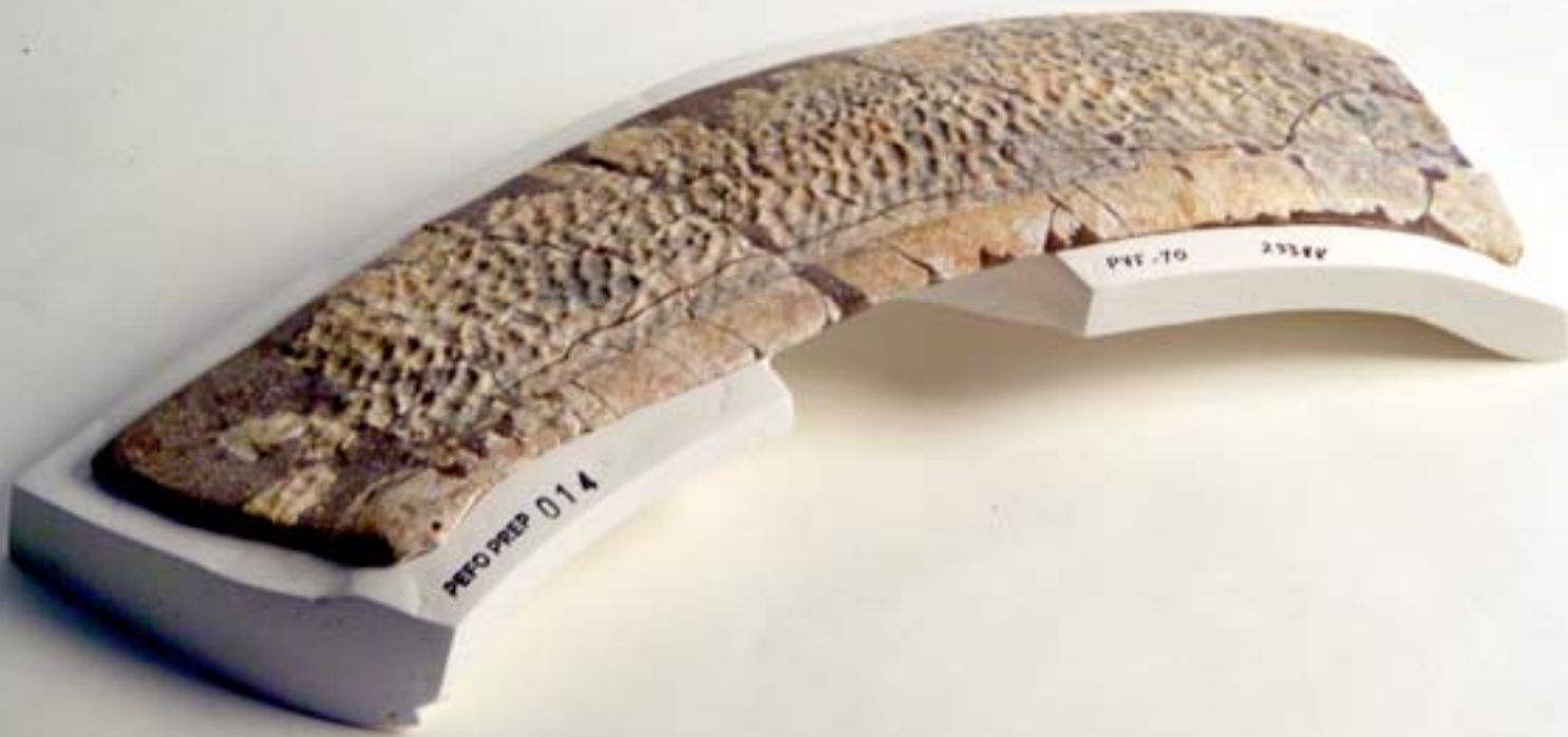
The specimen in its cradle.