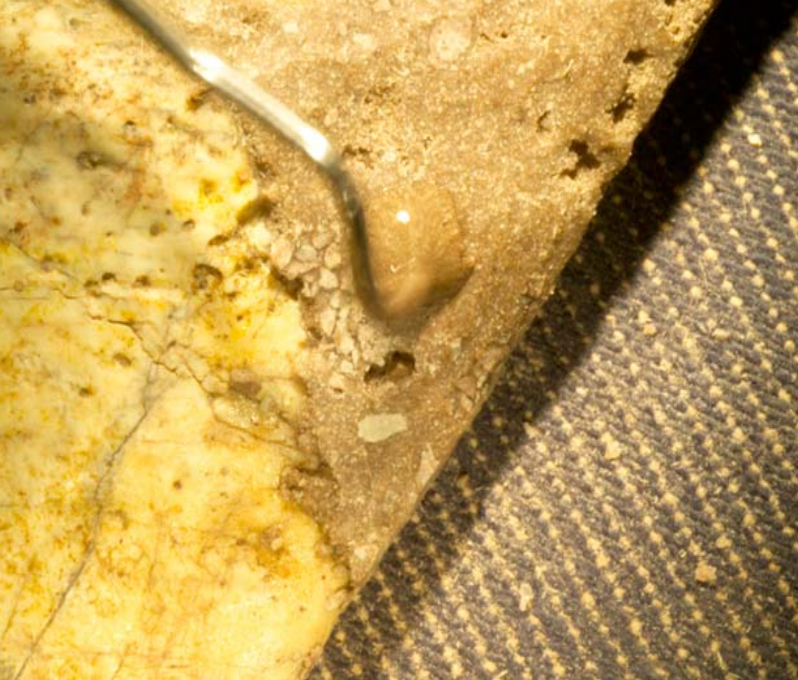
(9) Homing in with the drop of mix on the pick.