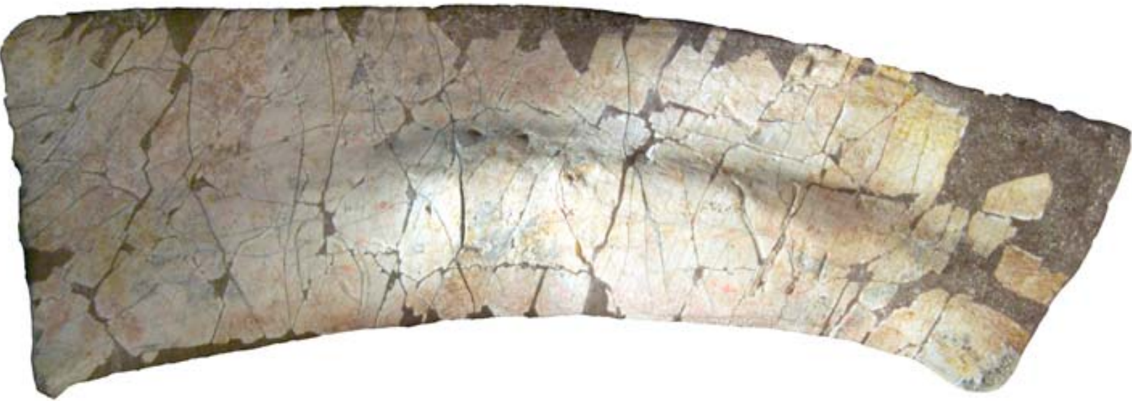
Ventral view of the complete scute.