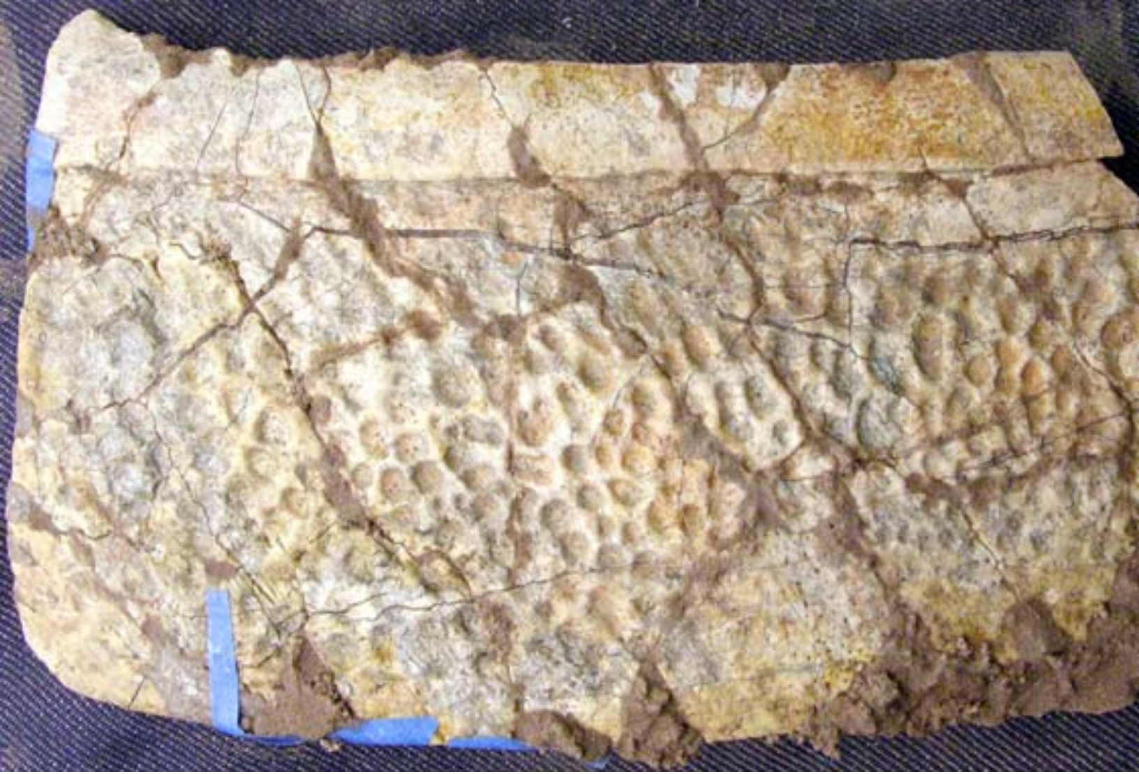
The dorsal surface of the same half-scuta showing the uneven surface of the filler from multiple applications.