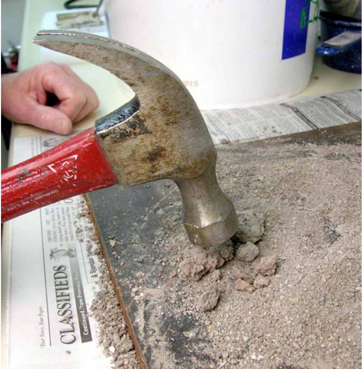
(3) Matrix, processed to make aggregate for the system, was pounded with a hammer on a steel plate and the crushed rubble swept onto the newspaper underneath it.