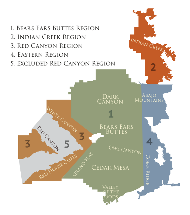
Map 1. Five regions with scientifically important paleontological resources in Bears Ears National Monument.

All of the areas of Bears Ears contain scientifically invaluable paleontological resources, and thus justify the existing boundaries. Furthermore, the area at the western end that is currently excluded also contains significant scientific resources and deserves to be added to the monument. To justify this point, we have divided the monument into five regions ( Map 1 ), each with a broadly similar geology, and describe the resources in each area.